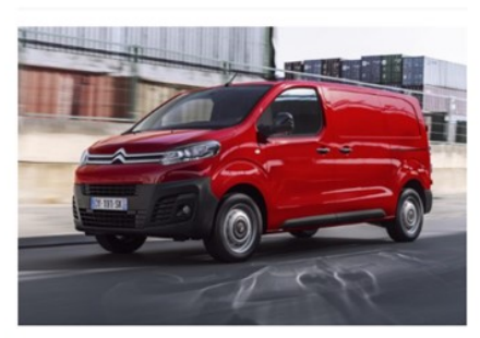
Interrogé par Les Echos, le groupe français a confirmé le lancement d'une vaste offensive électrique dans le domaine de l'utilitaire.